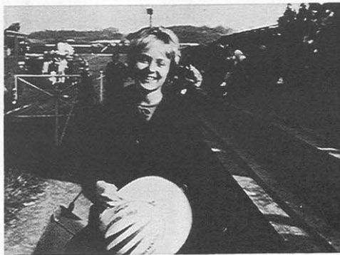
QUEEN JEANNE MEDDING