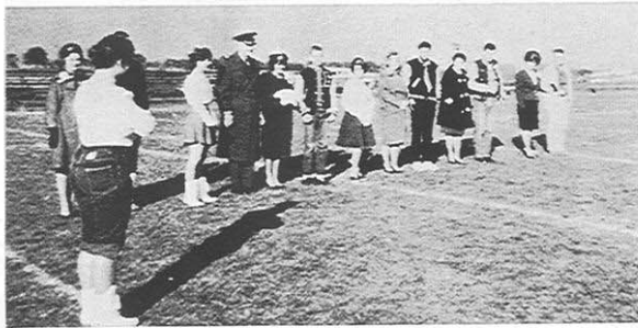
1962 Homecoming Court