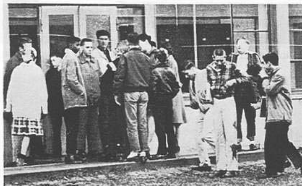
A Chilly Day