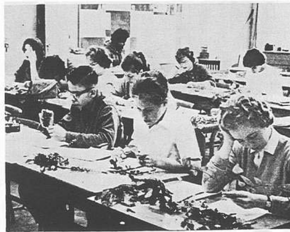
Dig those crazy leaves!