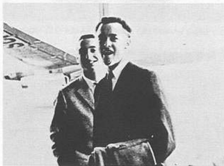
Traveling or going someplace?