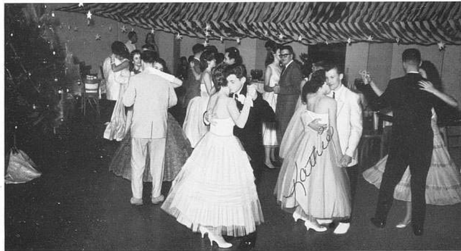
to remember at B. H. S.