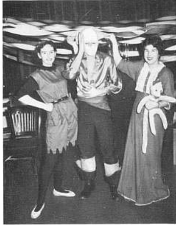
Time out for celebrations