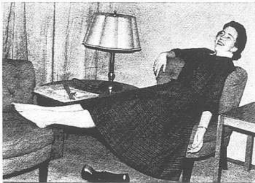
What a relief!