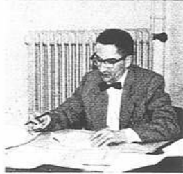
In New Hampshire-