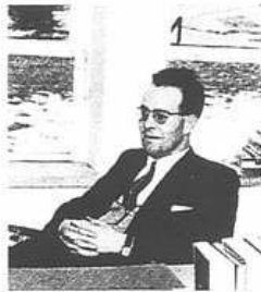
At the game- Satisfaction