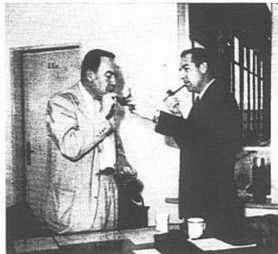
Ah, School's out!