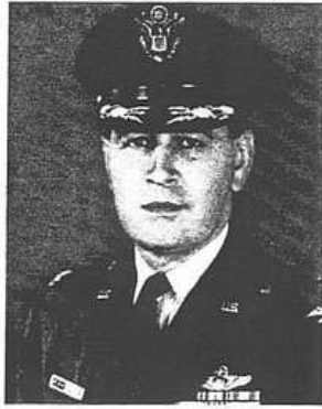
COLONEL WALTER B. PUTNAM Commander 36th Fighter-Day Wing