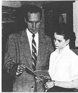
Here's an idea-